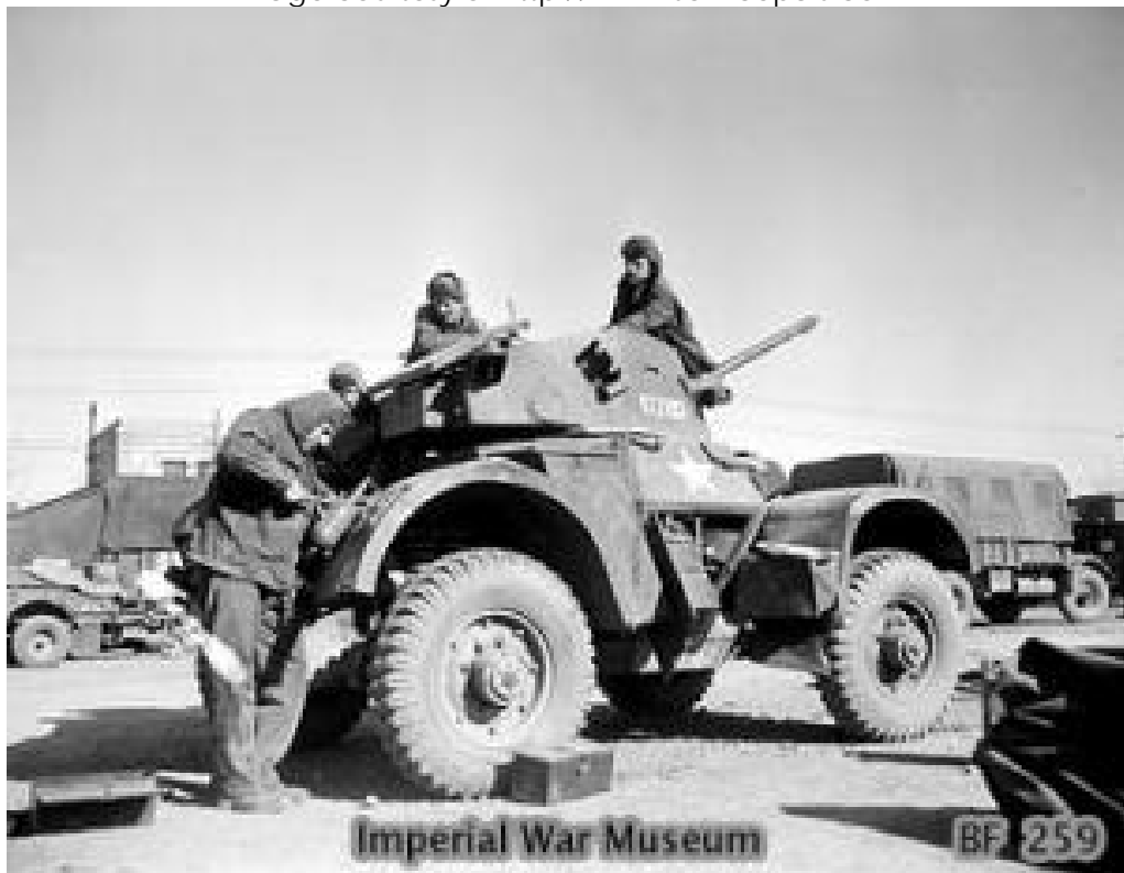
Title: THE KOREAN WAR 1950 - 1953

Dingo F205464 / 05ZS00 'This was my baby during the conflict. We got in a few tight spots but survived. We done recce's and moved important people around'.