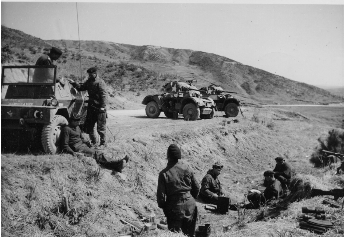
Photographer: Sidney Sherriff, Royal Armoured Corps 1949 – 1951

Description: A Royal Armoured Corps long range patrol group set up a fire base under the command of Sidney Sherriff. The group is equipped with Dingo F47685 09ZS70 HARGREAVES and Daimler armoured cars.